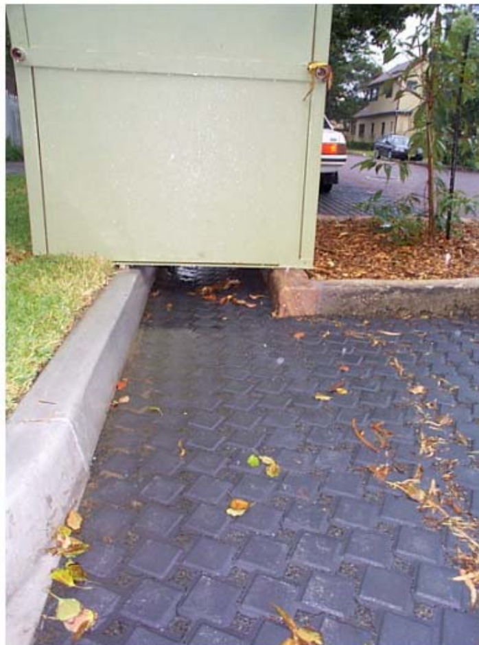
Figure 4. The stormwater monitoring station at the gutter.

Figure 4 shows details of the gutter in Smith Street. It will be noted that the pavers were laid to the kerb to form the gutter and that a shed was installed over part of this gutter to house all the instruments listed above except for the pluviometer. The monitoring shed was located on the footpath and tree surround so that it would not disrupt the flow of water in the gutter at the edge of the road.