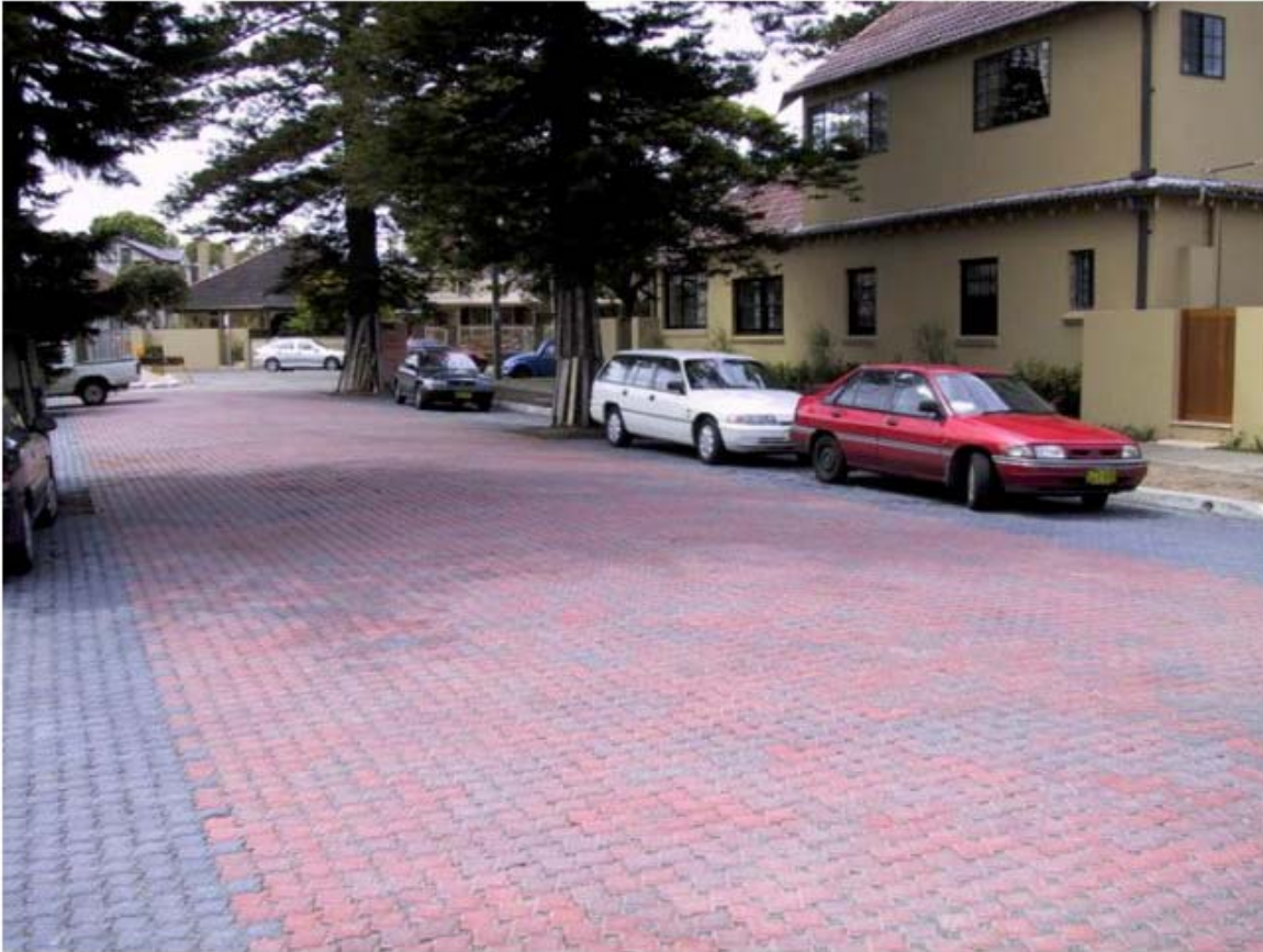
Figure 2. The finished pavement.