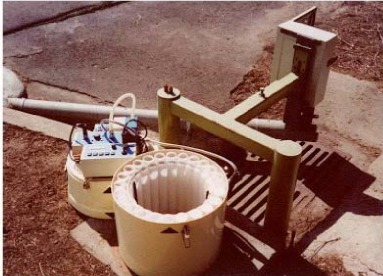
Figure 3. Gamet grab sampler showing sample bottles.

Figure 4 shows details of the gutter in Smith Street. It will be noted that the pavers were laid to the kerb to form the gutter and that a shed was installed over part of this gutter to house all the instruments listed above except for the pluviometer. The monitoring shed was located on the footpath and tree surround so that it would not disrupt the flow of water in the gutter at the edge of the road.